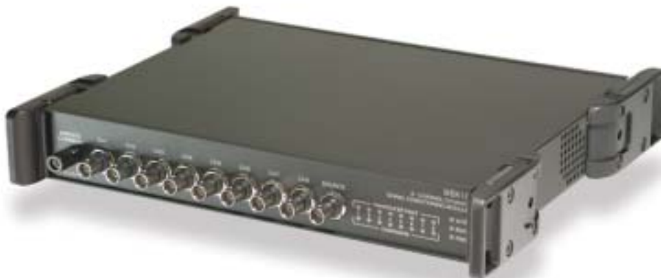
The WBK18 provides a full set of features for making dynamic signal measurements

The WBK18™ provides 8 channels of dynamic signal input for WaveBook™ or ZonicBook™ systems. The WBK18 provides all of the signal conditioning and biasing required for the system to accept piezoelectric accelerometers, piezoelectric pressure sensors, piezoelectric microphones, proximity sensors, or any other dynamic input source. All channels on the WBK18, and on other WBK18 modules within the same system, are sampled simultaneously to insure phase matching between channels. Each WBK18 channel features a software programmable 8-pole low-pass filter to remove undesired frequencies and alias components. Data integrity is additionally insured through overrange and ICP® fault detection mechanisms.